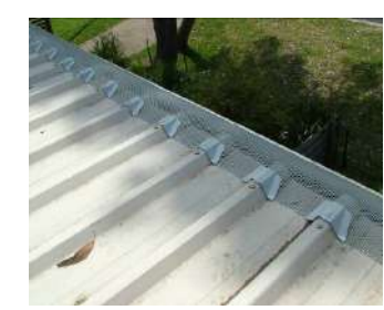
Trim deck Roof Finish