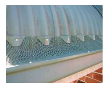
Bull Nose Roof Finish

NOTE: For Bull nose & Trimdeck roof follow steps 1-4 of Corrugated roof instructions.