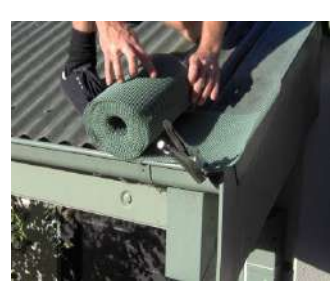
Step 1 : Mesh is clamped to beginning edge of gutter.