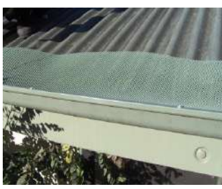
Step 2 : Trim is fixed to gutter lip