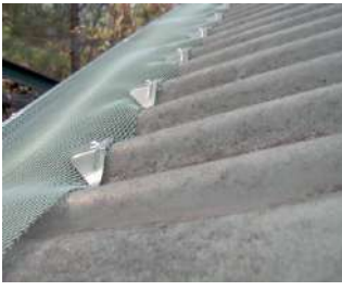
Step 4 : Saddles are screwed on every second corrugation.