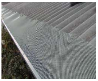
Step 3 : Mesh is then slit every second corrugation. The slit is along each side of the corrugation and should not exceed 20mm.