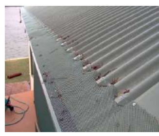
Step 5 : Finish product.

NOTE: For Bull nose & Trimdeck roof follow steps 1-4 of Corrugated roof instructions.